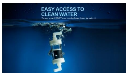
Fig 1. Prototype of the m-PEF system

* E. Coli , Legionella pneumophila , Pseudomonas aeruginosa , Aemonas sp and Mycobacterium sp