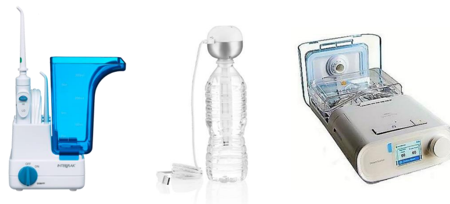
Fig 3. Some examples of household and medical applications