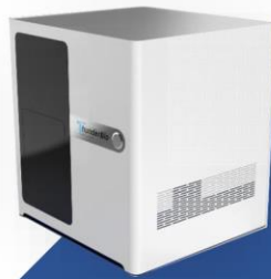
ddPCR lite System