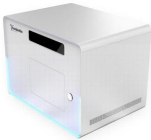
ddPCR Pro System