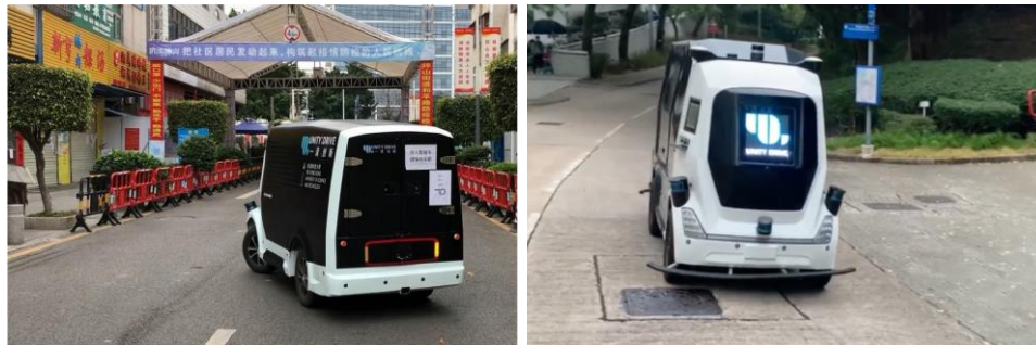
Fig 1. Test of the autonomous vehicle in Shenzhen, China, (left) and The Hong Kong University of Science and Technology (HKUST) (right)

The autonomous vehicle is composed of hardware and software systems including sensors, cloud server modules and algorithms to achieve autonomous navigation with a dynamics-based Model Predictive Controller (MPC)